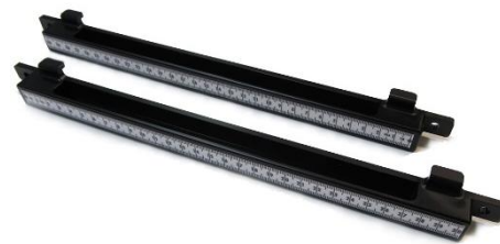
32145/5 (left) and 32145/6 (right)

HP Breast Board Adapters allow the attachment of 2-points breast masks to the board. The adapters should be screwed in to the board at the level of the grid. Both adapters have a millimeter scale running from 0 to 30mm. The position 0 mm should be facing the cranial side of the board.