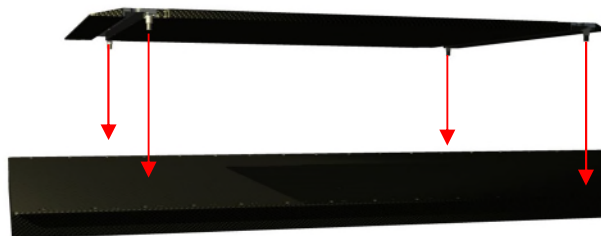
Indexing pins on Pelvicast Base Plate (ref. 32124)

Compatible base plates have 4 holes on the bottom into which the indexing pins can be screwed. The 32126 set contains four of the described Indexing Pins that are screwed into these holes. The holes are positioned in such a way that the pins will index to the holes on the side of the couch top.